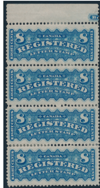
470 * #F3 1876 8c blue Registration Stamp, a mint hinged upper marginal vertical strip of four, with small part of the imprint in the top margin, with deep, fresh colour and fine-very fine. A few separation areas have been sensibly hinge-reinforced. Catalogue value is for four stamps only. AC ..... Unitrade $2,500