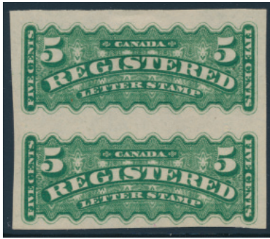
466 * #F2c 1876 5c green Registration Stamp Imperforate, a mint vertical pair, hinged on top stamp and very fine. AC ..... Unitrade $1,500