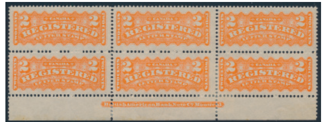
429 */** #F1 1875 2c orange Registration Stamp, a mint sheet margin block of six, with four never hinged stamps (both at left plus top two right stamps) and showing the full printer's imprint in bottom margin. Catalogued as two very fine never hinged, two fine hinged and two fine never hinged. A lovely and fresh block with bright colour. Rsv. ..... Unitrade $1,350