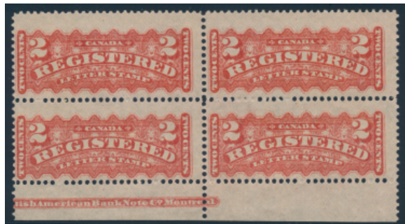
449 ** #F1b 1888 2c deep rose carmine Registration Stamp, a mint sheet margin block of four, with over 90% of the imprint in bottom margin, with fresh colour and fine centered. Bottom two stamps are never hinged, top two lightly hinged and at least three stamps show small gum dulling spots, still a nice block. AC ..... Est $350