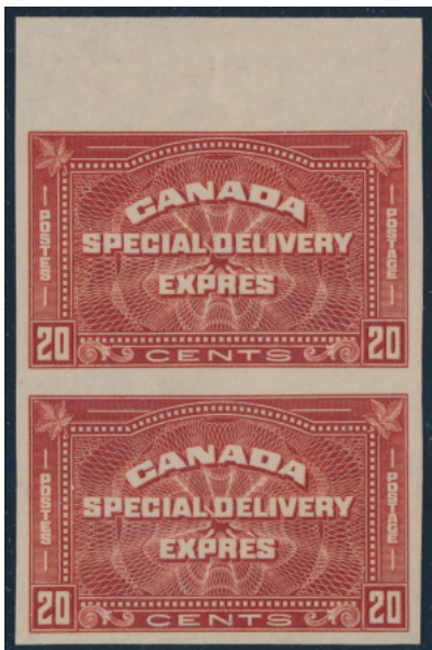
423 ** #E5a 1930 20c henna Special Delivery Imperforate, a mint never hinged top sheet margin vertical pair, very fine. Accompanied by a 2016 Greene Foundation certificate. Rsv. .... Unitrade $1,600