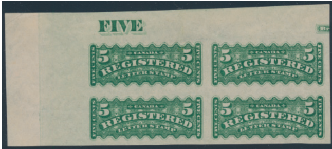
467 */** #F2c 1876 5c green Registration Stamp Imperforate, a mint upper left corner block of four, top stamps hinged, bottom pair hinged, showing full "FIVE" shaded counter plus part of the printer's imprint at right, quite fresh and extremely fine. Accompanied by a 2018 Greene Foundation certificate. Catalogue value is for two pairs only. Rsv. ..... Unitrade $4,500