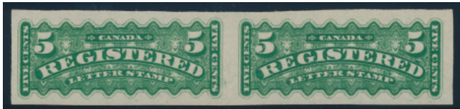
468 (*) #F2c 1876 5c green Registration Stamp Imperforate, an unused (no gum) horizontal pair, very fine. AC ..... Unitrade $1,500