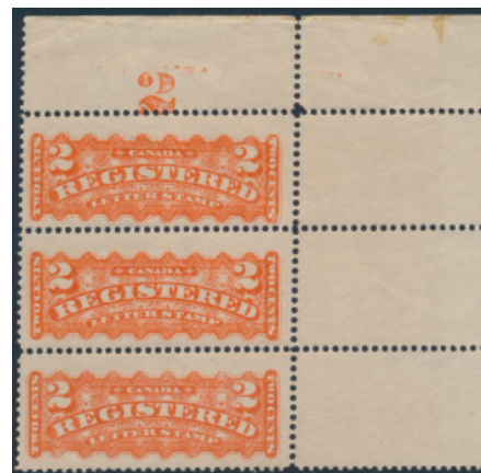
453 ** #F1i 1880s 2c orange red Registration Stamp, a mint upper right corner strip of three, with full original shiny gum, never hinged. Upper margin shows counter "2" and the stamps have bright colour and are overall fine-very fine. Stamps alone catalogue $1,140. AC ..... Est $250