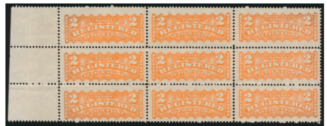
428 */** #F1 1875 2c orange Registration Stamp, a mint block of nine, with sheet selvedge at left, with full original gum. Three stamps are hinged and two have small black mounting marks on gum (counted as hinged), very fine. Rsv. ..... Unitrade $2,550