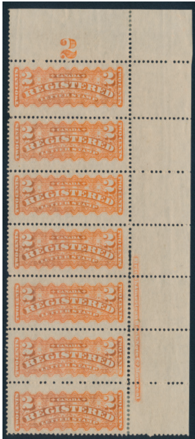
425 ** #F1 1875 2c orange Registration Stamp, a mint never hinged upper right strip of seven, with full original dull gum. The top margin shows a "2" counter and the right side shows the full printer's imprint. Overall very fine. AC ..... Est $350