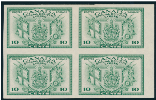
424 ** #E10a 1942 10c green Special Delivery Imperforate, a mint never hinged right sheet margin block of four, with small "HHH" owner's handstamp (Henry H. Hopkins) on back of each stamp. Very fine. Rsv. .... Unitrade $2,400