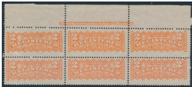
426 ** #F1 1875 2c light orange Registration Stamp, a mint never hinged (light hinges in margin only) upper marginal block of six, with full original gum, showing the full printer's imprint in top margin. The left pair has a vertical crease, and the top right stamp has a natural diagonal crease, else overall fine. AC ..... Est $100