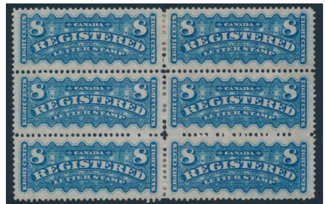
471 * #F3 1876 8c blue Registration Stamp, a mint hinged block of six, with deep, rich colour and each stamp very well centered. The sensible hinging helps reinforce some separation. A remarkable and fresh block and very fine. ..... Unitrade $5,400