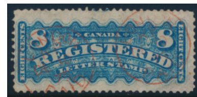
472 © #F3 1876 8c blue Registration Stamp, a used single with two strikes of a LONDON / PAID c.d.s. receiver in red dated DEC.10.1875, fine. Harrison states on page 293 that the 8c RLS stamps were available by October 1875, but that none are known used before March 2, 1876, so this is a major discovery. To put it in perspective, the earliest recorded 2c RLS is dated DEC.13.1875. A rare and desirable stamp which also happens to show part of the counter "8" at top. AC ..... Est $500