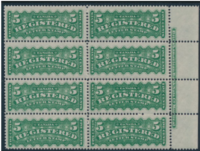
469 ** #F2i 1876 5c green Registration Stamp, a mint never hinged right sheet margin block of eight, with deep, bright colour and impeccable gum. Also shows the full printer's imprint (Bogg's type V) in right margin. An exceptionally fresh block, very fine. Accompanied by a 2016 Greene Foundation certificate. Catalogue value is for 8 singles only. Rsv. ..... Unitrade $4,800