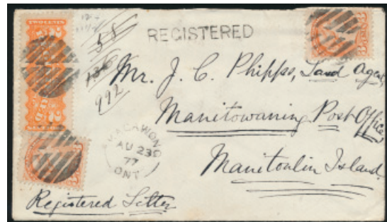
452 ✉ #F1d 1877 Registered Cover Kagawong to Manitoulin Island, mailed Kagawong on AUG.23.1877 (this is a new earliest recorded date for this datestamp) to Manitoulin Island, with Spanish River AUG.29 transit on back alongside a Manitowaning Lake Huron broken circle dated 1877 / SP 1 (year is above). The cover is franked with two 3c Small Queens (presumably for double weight) plus a 2c RLS (all three perforated 11½ x 12), all cancelled by fancy cross hatched corks. A very fine and scarce cover which took one week to get to its destination. AC ..... Est $150