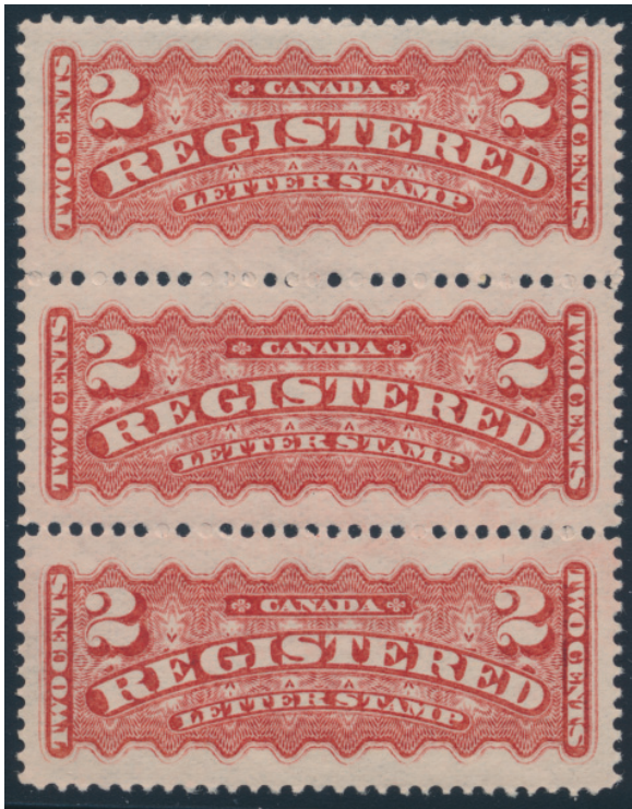
448 ** #F1b 1888 2c deep rose carmine Registration Stamp, a mint never hinged vertical strip of three, with fresh colour and nicely centered, very fine. A lovely multiple. AC ..... Unitrade $4,500